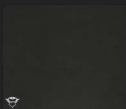
PRODUCT TOP 1