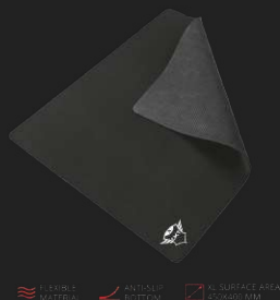
PRODUCT ESHOT 1