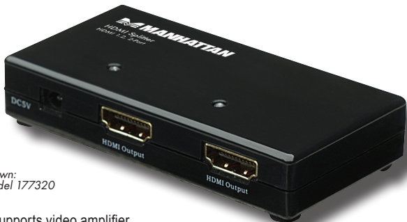
Shown: Model 177320

Duplicate a high-definition digital audio/video signal for two HDMI outputs, or cascade up to three levels for even greater distribution!