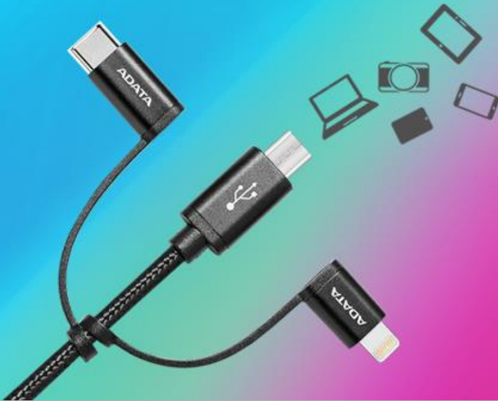
Lightning 3-in-1 Cable