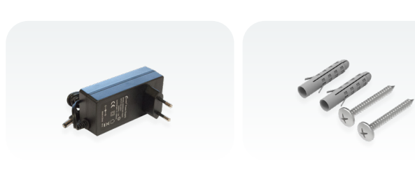
24 V 1.5 A power adapter